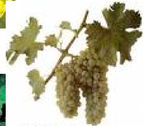
Chenin Blanc